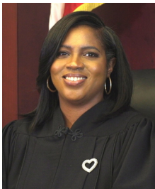
Timika Lane PA Superior Court